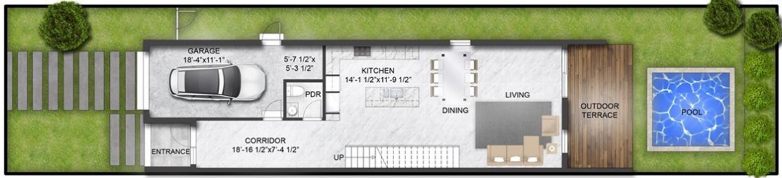
FIRST FLOOR PLAN ON SITE